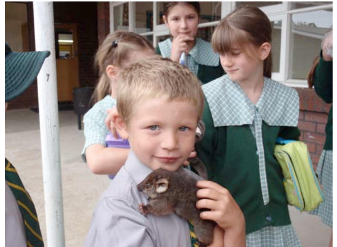
A cute little possum came to visit the school. He made a lot of new friends.