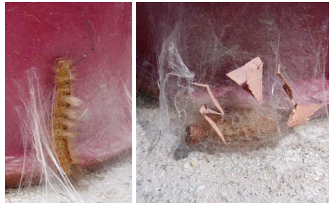
This amazing caterpillar is building himself a cocoon! He completed this much in a couple of hours.