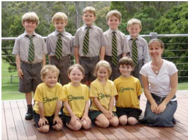
The Kinder and Prep Class having their photo taken on the new deck ☺