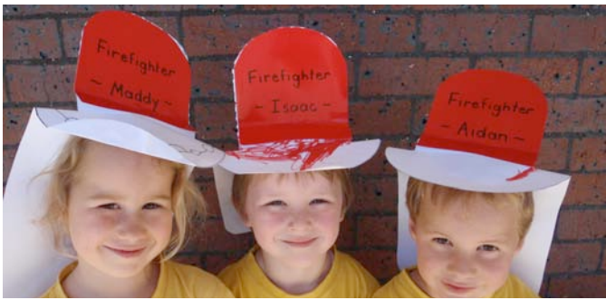
The Kinders bravely fighting an imaginary fire!!!