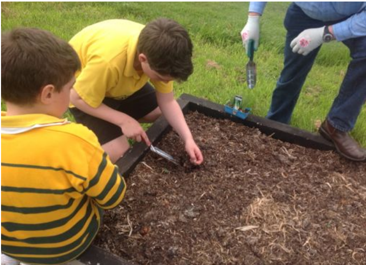
Stephanie Alexander Kitchen Garden Project.