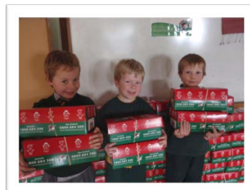
Wow! Look at all those shoeboxes!!