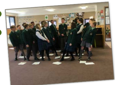
Grade 7 practicing group bible speaking for convention.

We encourage parents to help practice with their children and invite parents to watch their children perform at the Devonport Entertainment Centre.