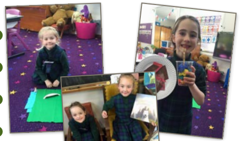
Prep watering their classroom seeds and making science inventions