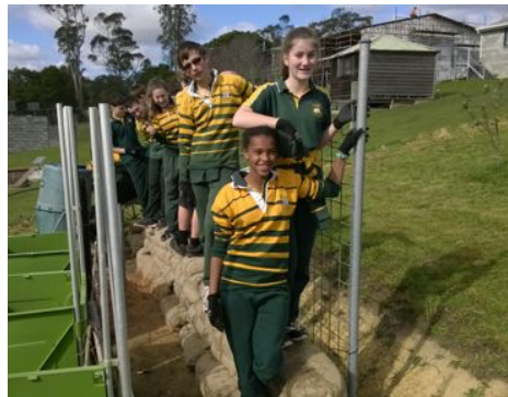
Year 7&8 built a sandbag retaining wall today. Great effort by all involved.

And so, on Friday, September 19 th , we are going to have a Great Outback BBQ here at school! All students will need to bring $2 for the sausage sizzle and wear jeans and a checked shirt ☺ Let's help encourage and support our Aussie farmers!!