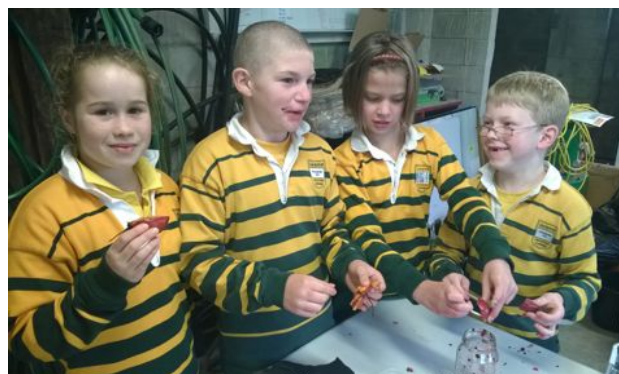
(Left) Saving seed from Tamarillos.