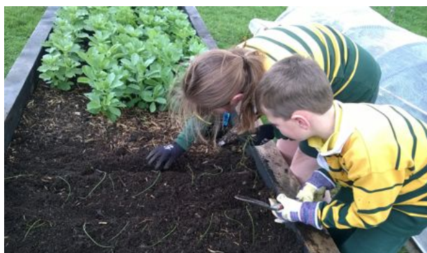
(Left) Planting onions in between the rain drops!