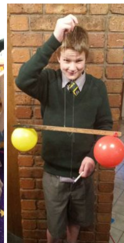
Some of the beautiful, cheerful faces around our school ☺