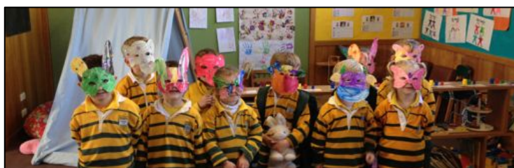
I don't even know which class this is! They're so beautifully disguised!