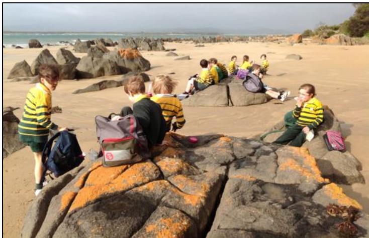
The Grade 1&2 Class having a lovely, windy lunch at the beach

Yesterday we went to the beach at Hawley. It rained to start with, but then the sun came out and it was beautiful weather. We had so much fun climbing over rocks, finding sea urchins and starfish, and collecting pretty shells and rocks. We ate lunch on the beach, watching the waves. Everybody has worked really well this term, well done!