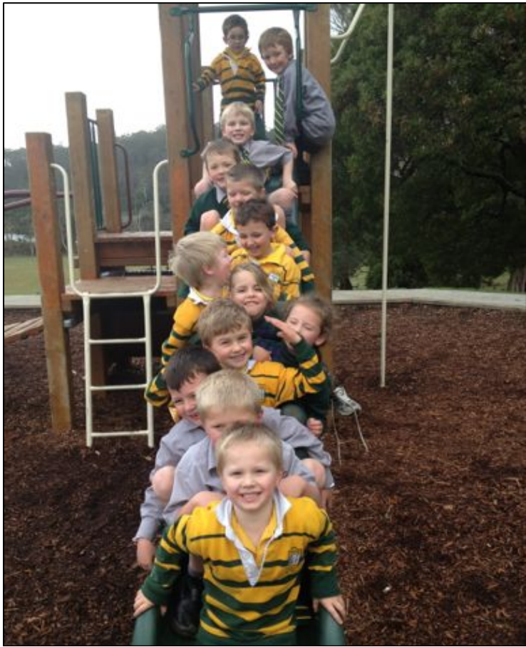
The whole Prep Class can fit on the slide! Wow!!