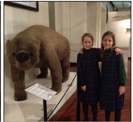
The Grade 3&4 Class had a very exciting adventure at the Queen Victoria Museum ©