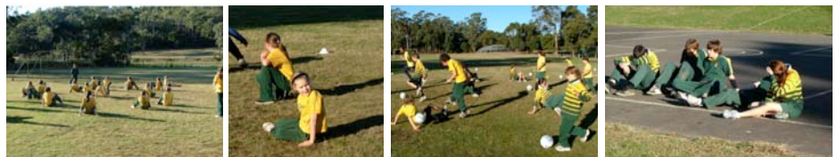
The Futesol Program being put into action by Geneva students.