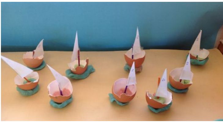
The Kinder's beautiful egg-shell boats and snowmen!