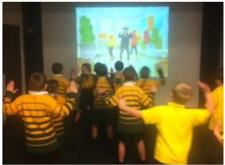
The students are really enjoying doing dance in drama!!