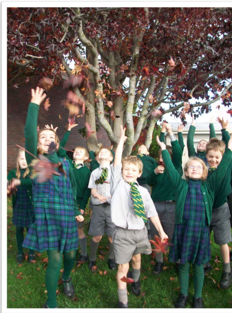
The Grade 1-3 class enjoying a frolic in the beautiful autumn leaves! Isn't God's creation wonderful!