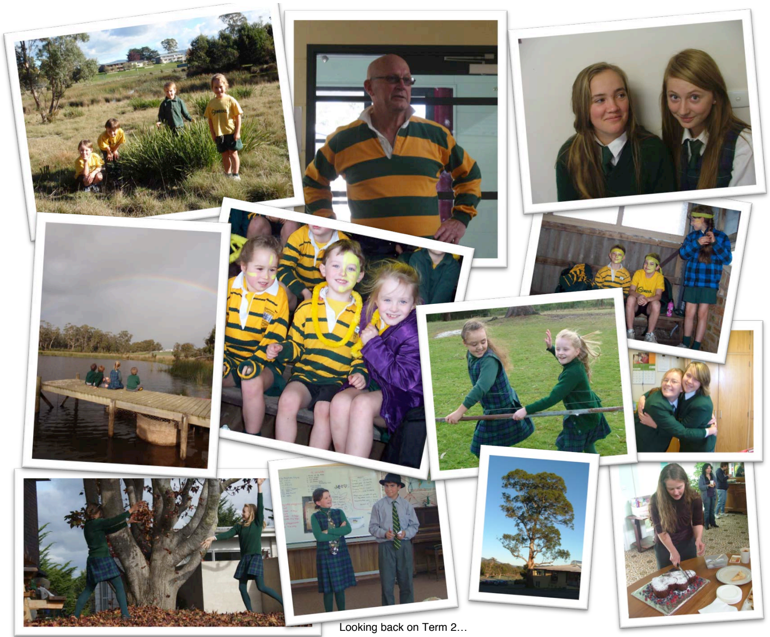
Looking back on Term 2...