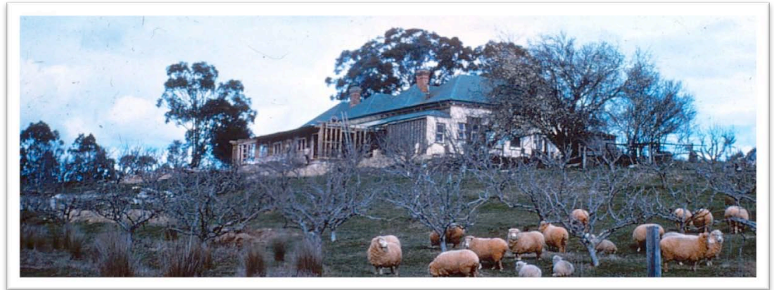
The original farm building – now the administration building!

It's with grateful thanks to God that we look back over the last 5 decades of Geneva's history and see how He has loved and blessed us in so many ways. This coming Sunday, July 4 will be exactly 50 years since the first folk arrived here at Geneva and a work for God commenced. We acknowledge them at this time and are encouraged by their pioneering spirit.