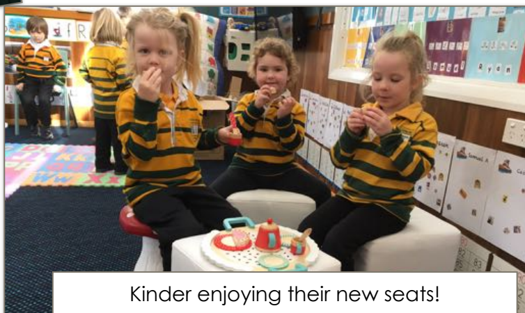
Kinder enjoying their new seats!