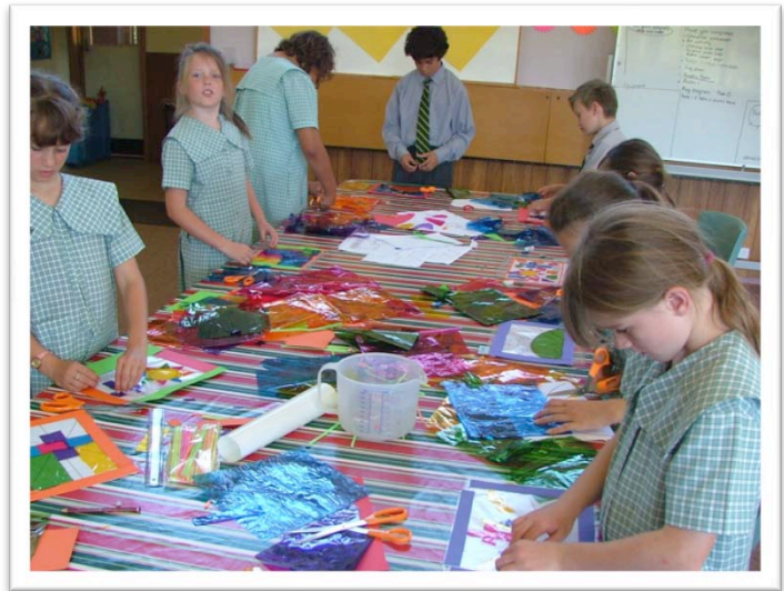
The 4-6 Class working on their stained glass windows!

This week has been a flurry of activity. Grade 4/5/6 have worked diligently and have finished all their work for the term. Along with this, we have built a bridge that spanned a meter between two chairs. Our bridges all supported the weight of a toy car and the car could travel from one end of the bridge to the other without falling off. We also took time to consider Easter. We remembered Jesus's death on the Cross and His resurrection. As a reminder we made 'transparent' pictures that are now allowing coloured light into our classroom. Some of us designed our own picture, others used a template.