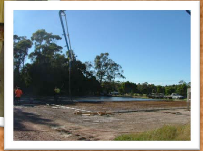
The "front office" under construction and the new gym slab being poured 😊