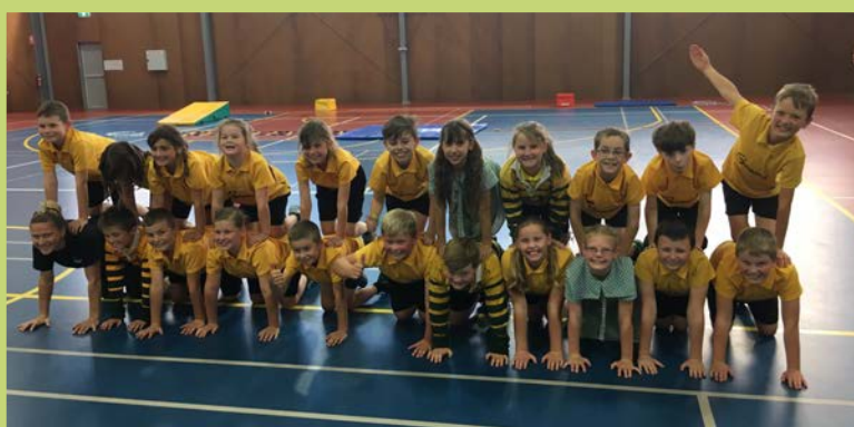
This Term, Grade 3-6 have been having circus lessons for their block of sport each week. This is run by Slipstream circus. The kids have really enjoyed the circus, as you can probably see from the photo!

Grade 5 and 6 players are eligible to referee games on a Saturday morning. Interested players will need to attend a training session on Monday 27th March 7.30pm OR Wednesday 29th at 6pm. Sessions go for approx 1.5 hours.