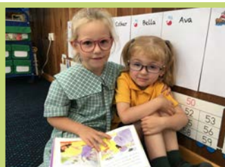
Preps enjoying special reading time with Kinders