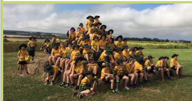
On Monday, Grade 3-6 visited Rupertswood Farm Crop Maze for an excursion. This was great day out for all students! Here they are on top of a haystack!

Devonport Junior Soccer have begun their DJS Development Centre Training (Formally DJS Representative Soccer). Each Wednesday 4pm-5pm, at Meercroft. Any grade 3-6 players wishing to have another training session are more than welcome. Girl numbers are low at the moment and we would love to see them this week! Players will also have the opportunity to play in the Hobart, Devonport and Launceston Cups.