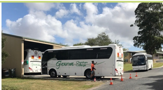
A BIG thank you to Mr Forward (Davis) who washes and cleans our big buses on a weekly basis! It's a big task to keep our buses looking great!

Ideally around Devonport, Latrobe or Port Sorell area. Please call Tamie on 0481 092 603 if you have something available.