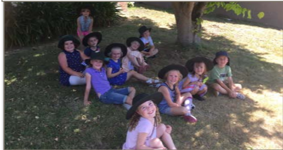
Here are the Prep's enjoying the shade while listening to a story.

Please return the health forms that were emailed out. They are now OVERDUE. We need an updated form for EACH child at the start of the year. Thank you all parents who have returned their forms already.