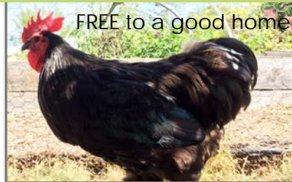
FREE to a good home

Maisie Bond for enthusiasm and diligence in reaching goals